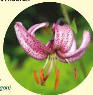
Turška lilija Martagon Lily ( Lilium martagon )