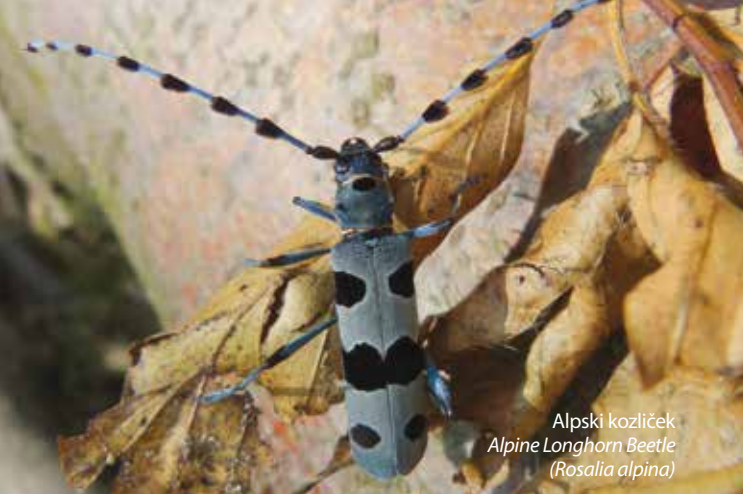
Alpski kozliček Alpine Longhorn Beetle ( Rosalia alpina )

Grajska pot Podsreda se nahaja v osrčju Kozjanskega parka in je del pešpoti Podsreda. Poteka po srednjeveškem trgu Podsreda, mimo Levstikovega mlina na reki Bistrici ter nato skozi gozd do gradu Podsreda. Pot je označena s smernimi in informacijskimi tablam, s pomočjo katerih boste raziskovali izjemno biotsko pestrost in bogato kulturno dediščino.