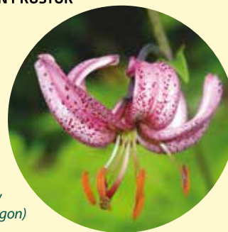
Turška lilija Martagon Lily ( Lilium martagon )